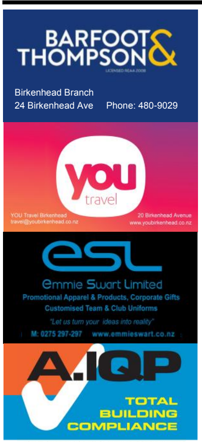
ASBESTOS MANAGEMENT PLANS